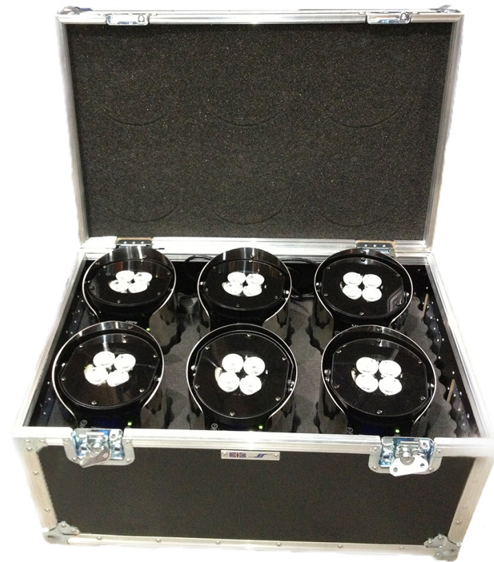
CP Box can carry six pieces of ColourPoints

Can be installed as mains-powered permanent fixture with special order. Wireless DMX control